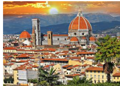
Basilica of Saint Mary